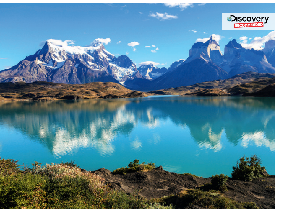
PUNTA ARENAS, CHILE: Torres del Paine National Park – Take a grand adventure that travels from the desolate steppes of Patagonia to one of the most spectacular scenic regions in the world.