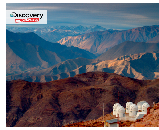
LA SERENA, CHILE: Tololo Observatory & Elqui Valley – Feel like a professional astronomer on a special guided tour of Tolo Observatory – the sixth-largest astronomical observatory in the Southern Hemisphere.

Princess Cruises® is proud to offer excursions that are not only fascinating for the whole family, but recommended by two of the most trusted names in world travel – Discovery™ and Animal Planet.™ Plus tours created exclusively for Princess are also available.