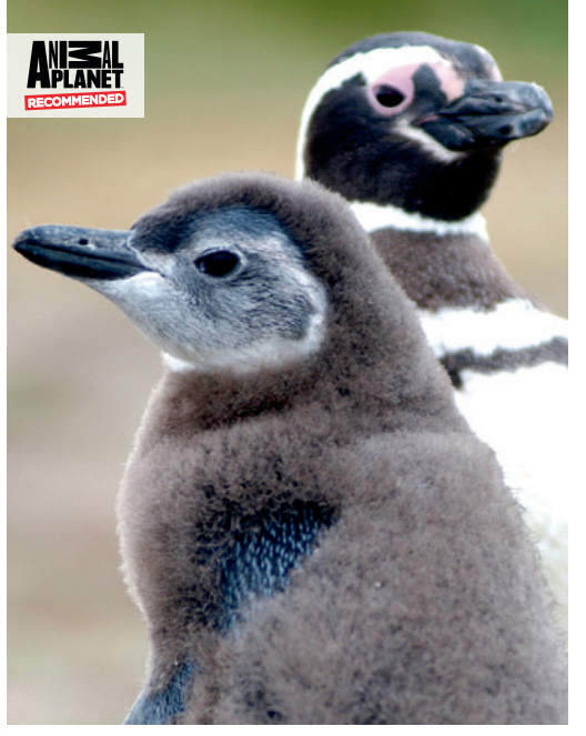
FALKLAND ISLANDS: Sparrow Cove Penguins - Thrill at the sight of gentoo penguins as you venture to the protected Sparrow Cove Penguin Reserve by boat and 4-wheel-drive vehicle. Set against the backdrop of sandy white beaches and the jagged peaks of Mount Lowe, Sparrow Cove is picture-postcard perfect.

©2016 Discovery Communications. All Rights Reserved. Discovery Channel, American Heroes Channel, Animal Planet, Destination America, Discovery Kids, Discovery Fit & Health, Discovery Family Channel, Investigation Discovery, OWN: Oprah Winfrey Network, Science Channel, TLC, Velocity, and their respective logos are trademarks of Discovery Communications. Excursions and schedule subject to change.