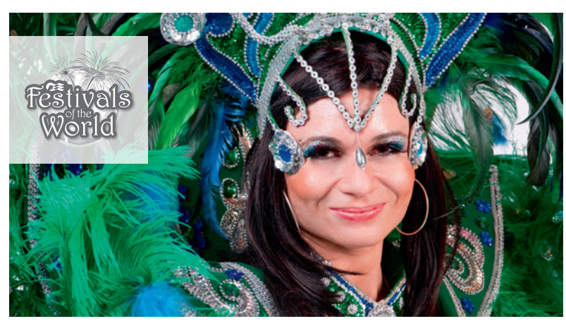
Festivals of the World: Take part in one of the world's greatest celebrations – Rio Carnival, where you'll be able to learn the samba, decorate a headdress, mingle at themed parties and watch dancers perform a traditional Carnival show.

Princess<sup>®</sup> brings South America to life with special offerings on ship and on shore. Expert guest lecturers and onboard programming put the spotlight on the region's unique culture and history, and performers come on board to dance the tango, play traditional Peruvian music, showcase the samba and more. And you'll sample authentic regional dishes and drinks of South America.