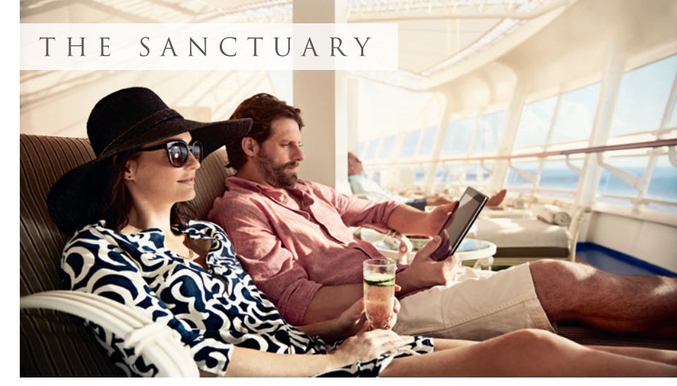
The Sanctuary: The soothing adult-only retreat, The Sanctuary, is an on-deck oasis offering massages, light snacks and refreshing beverages, and personal entertainment systems.