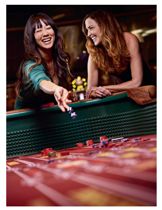
Casino: Thrilling games of chance and a sophisticated atmosphere are the allure in the exciting casino, where you can try your hand at slots, blackjack, roulette and more.

When the day is done, the fun is just beginning. From high-tech musicals to comedians, live music and more, every evening your Princess<sup>®</sup> ship comes alive.