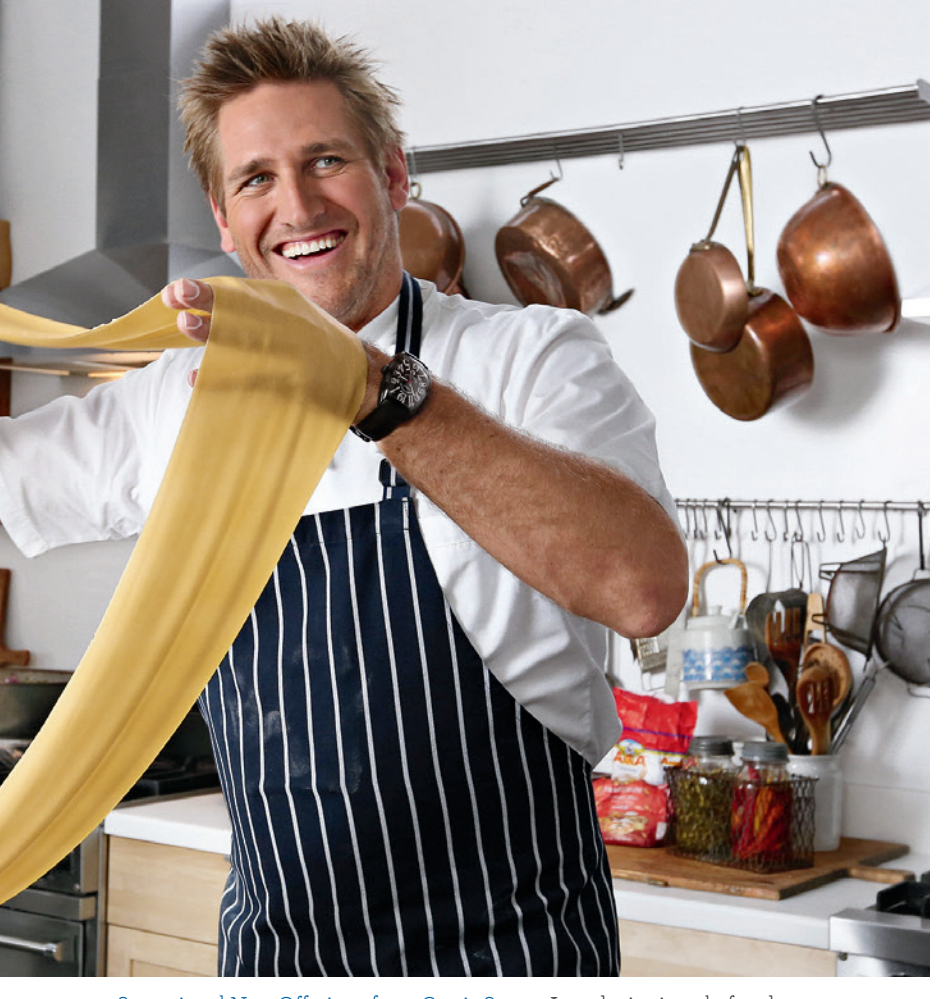
Sensational New Offerings from Curtis Stone: Award-winning chef and restaurateur Curtis Stone brings his passion for fresh seasonal ingredients and creative preparations on board with special dishes created just for Princess. "Crafted by Curtis" dishes are available in the main dining room on all ships, and SHARE, a new specialty restaurant by Curtis Stone is available on board Emerald Princess.<sup>®</sup> princess.com/curtis-stone