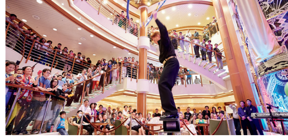
The Piazza: In the bustling Piazza, the ship's heart and soul, there's always something happening. Stop by anytime, day or night, to find musicians and street performers entertaining, or to simply have a cocktail or coffee with a friend.