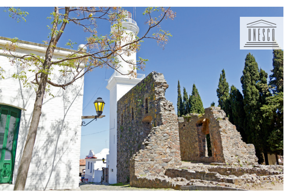
MONTEVIDEO, URUGUAY: Colonia del Sacramento – Explore Colonia del Sacramento, Uruguay's oldest town and a UNESCO World Heritage Site. Enjoy a narrated stroll along 17th-century cobblestone streets lined with colorful colonial houses. Visit the remains of a Franciscan Convent, a bullring, and the lighthouse.

With Princess,<sup>®</sup> you don't just get to see the best destinations you get to experience them just the way you want to with our array of award-winning excursions. Watch a traditional prancing horse show in Peru, wine taste in Chile's Casablanca Valley, learn to tango in Argentina and much more.