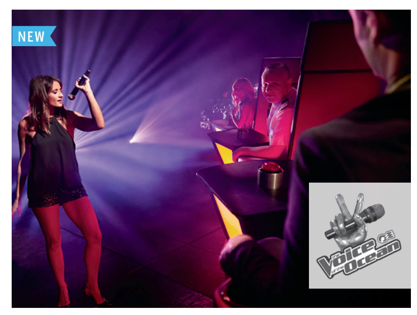
The Voice of the Ocean: Who among your fellow guests has what it takes to be a star? Enjoy the excitement and spectacle of TV's wildly popular international singing competition, The Voice of the Ocean , where you can compete, or help choose the winner. princess.com/voice