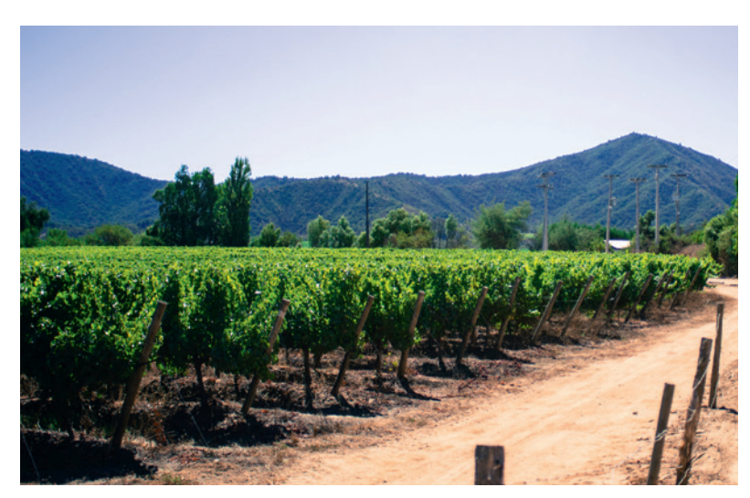
SANTIAGO, CHILE: Casablanca Valley Wine Tasting & Lunch – Enjoy wine tasting and a guided tour at William Cole Vineyards. Visit the entertaining Estancia el Cuadro for lunch and a folkloric performance before returning to Valparaiso for a tour of the city.