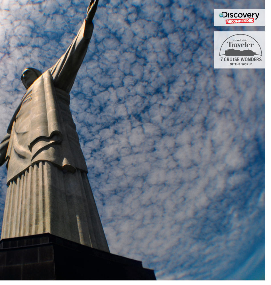
RIO DE JANEIRO, BRAZIL: City Drive, Sugarloaf & Christ the Redeemer – Experience the sights and sounds of Brazil's Cidade Maravilhosa. Ride a cable car to the top of Sugarloaf for a sweeping view of Rio and its white-sand beaches. Visit one of the Seven Cruise Wonders of the World, the statue of Christ the Redeemer on Corcovado Mountain.