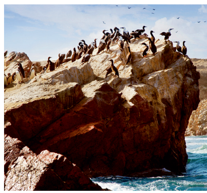
PISCO, PERU: Islas Ballestas Wildlife Cruise – Cruise to Islas Ballestas, Peru's Galapagos, for an up-close look at large populations of marine mammals and birds in their protected habitat. And, take photos at "El Candelabro," a figure etched into a coastal headland, reminiscent of the Nazca Lines.