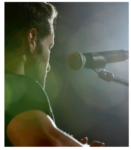
Nightlife: Enjoy dynamic nightlife throughout the ship — live music including pianists in the bars and lounges, dancing in the nightclub, illusionists, top-rated comedians and more.